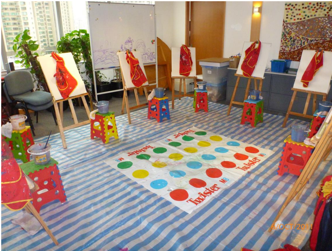
Figure 1. Photograph of the instructional setting